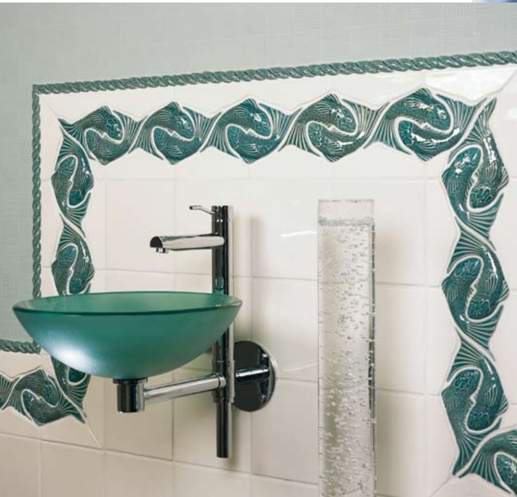
Tiles used in this setting: JZ5500 Alpine field tile, JA8902 Monterey rope twist, JA8800 Monterey single fish, JA8809 Monterey corner fish, KA8802 Snowdrop straight edge, KA8807 Snowdrop corner piece.

Exquisitely detailed and innovative, these interlocking fish can be used to devise, quite literally, unique designs for your bathroom. And there are five complementary edging and corner pieces to help you maximise your creativity.