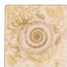
PERMIAN INSET* KHP5644