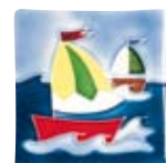
SAILOR SAM INSET 5303