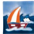
BARNACLE BILL INSET 5306