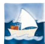
PIRATE PETE INSET 5304