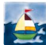
MARY CELESTE INSET 5302