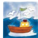
BILLY BUDD INSET 5305